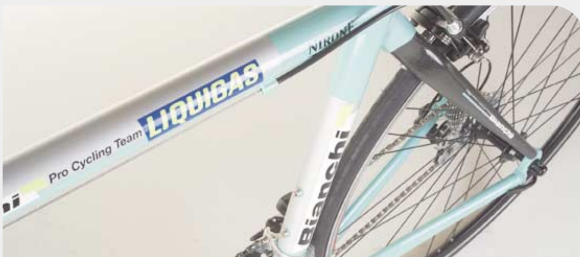
All the pictures refer to the model Via Nirone 7 Alu Carbon Mirage 10sp Compact.